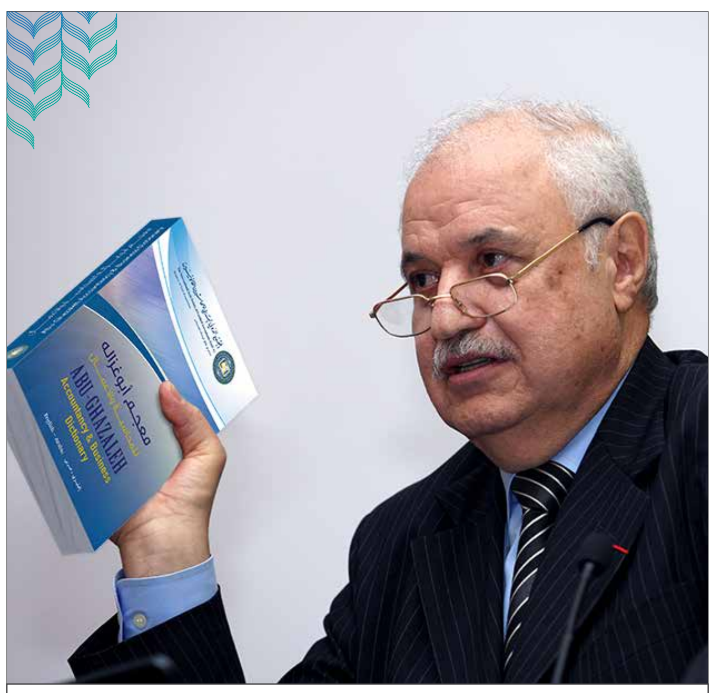
Launch of 3<sup>rd</sup> Edition of Talal Abu-Ghazaleh Accountancy & Business Dictionary